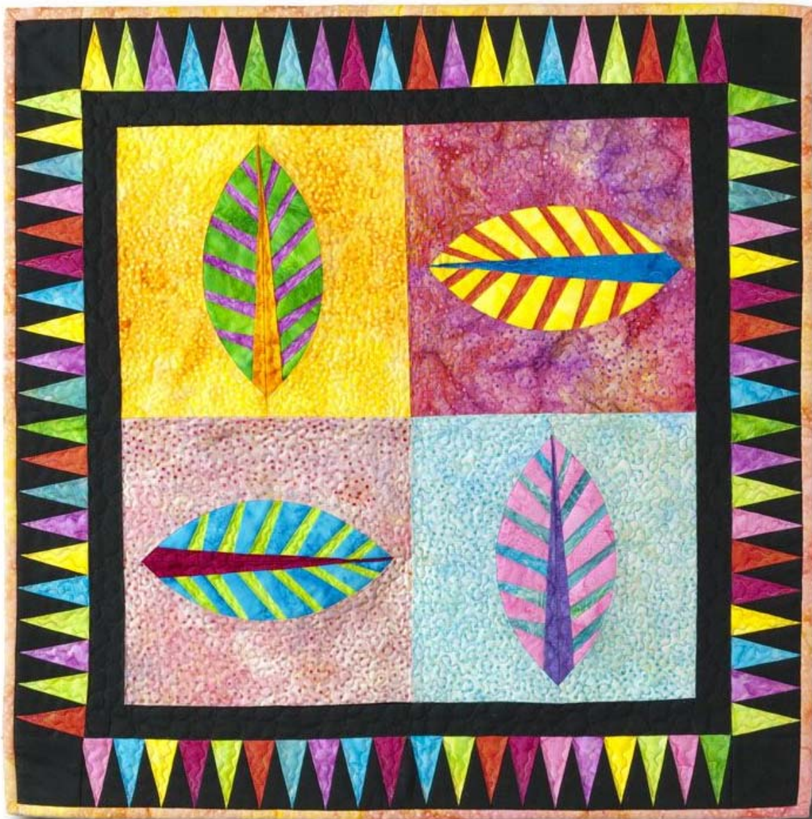
“Turning Over a New Leaf” © Deb Karasik 22” x 22”